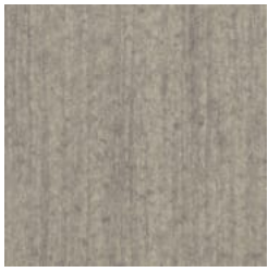
IRONBARK - TIMBER PET