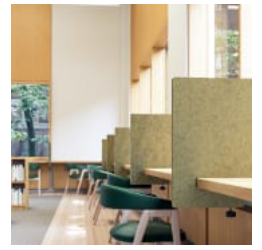
Inala Desking Divider Meadow