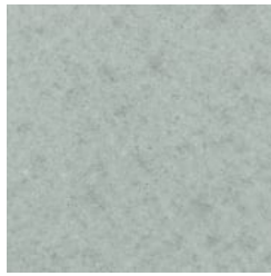
CADET - PET