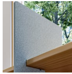
Inala Desking Divider Premium Material Raku Jade Detail