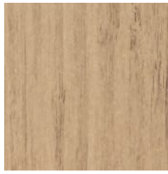
SPOTTED GUM - TIMBER PET