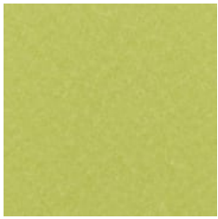
GRASS - PET